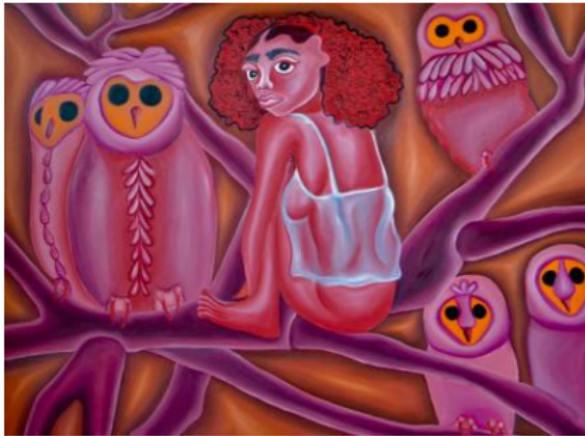
Dodi King at Cooper Cole

Offering yet another perspective on just what an art world might look like as we venture further into a tightly connected digital landscape, NADA's fair project seems to have found one way past the current landscape of challenges to the traditional art market practices, and offers just one more look at why their work as an institution and support network continues to remain compelling in 2020.