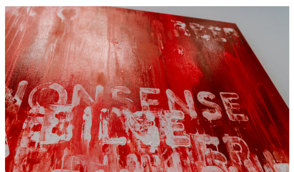
A detail from Mel Bochner's "Drool," part of his show "Voices," at Peter Freeman Inc. in SoHo.

PETER FREEMAN INC. The text paintings in Mel Bochner's latest show, "Voices," are big, colorful and, with the exception of a hand-lettered but breezy philosophical exegesis of what Cézanne meant by "truth in painting," made with stamps. Onomatopoeias abound in the works <a href="here">here</a>, as do exclamation points. "SQUAWK!," for example, is a nine-foot-high list of white-on-blue noises from the title on down through HISS!, HOOT! and HOLLER! to BELCH! More than one canvas includes terms this newspaper chooses not to print. But in these works the lettering's most important feature is its drips: Because Mr. Bochner's use of paint is exactly as messy and exuberant as his language, the paintings achieve the unusual feat of being conceptual but not too cerebral, readable in an instant but robust enough for sustained viewing.