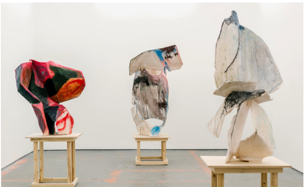
From left, "Mancha," "Elision" and "Sonámbulo," by Ernesto Burgos, from the exhibition "One Thing After Another," at Kate Werble Gallery in SoHo.

KATE WERBLE GALLERY Ernesto Burgos's sculptures in "One Thing After Another" — loops and whirls of cardboard treated with resin and sandwiched in fiberglass — look something like interesting accidents of crumpled paper writ large. Resting <a href="here">here</a> on open pedestals made of raw plywood, they range from four feet tall to as high as six. The unconsidered drips and scrawls of paint with which this Chilean artist covers them might seem self-indulgent, but they give the surfaces a visual texture that subtly complicates their kitchen-sink topology while also making it easier to follow. In "Hiraeth," for example, a yellow-green color gives tidal force to a broad, overhanging curve, while a steeply angled darker stroke swings across like a surfer before cutting back.