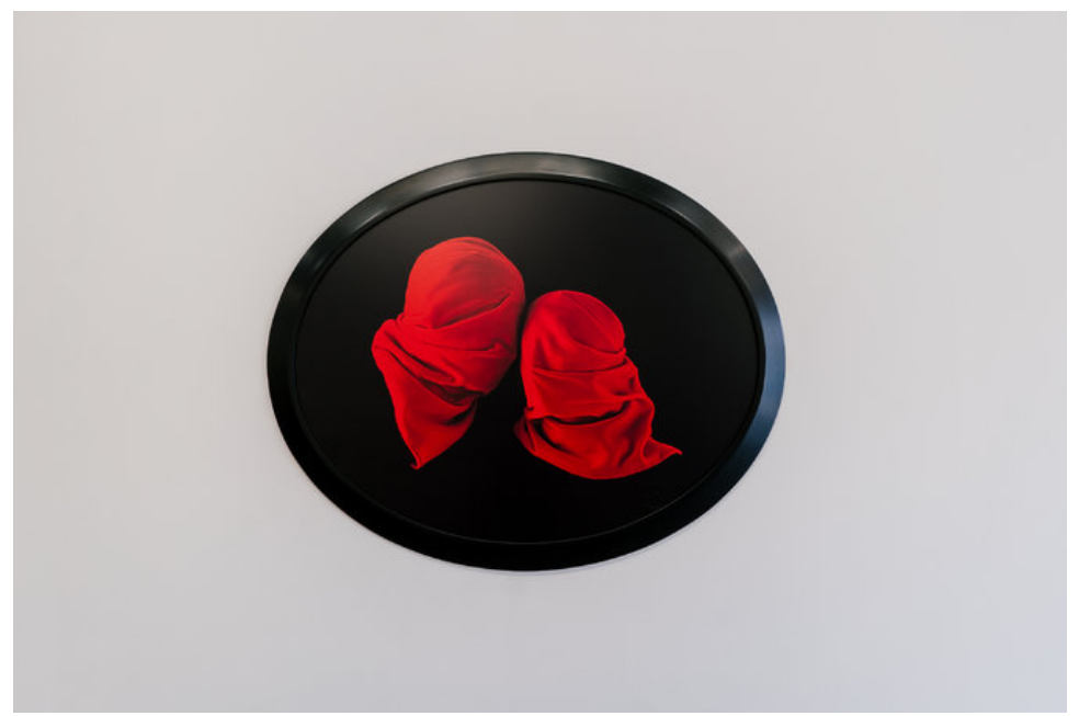
"Red Veils," by Sarah Charlesworth, in the exhibition "Natural Magic," at Maccarone.

MACCARONE Sarah Charlesworth's impeccable series "Natural Magic," which dates to 1993 but hasn't been shown in its entirety in the United States since, uses the handmade, willfully old-fashioned tricks of stage magic as metaphors for analog photography, and vice versa. Made up of 11 lusciously matte Cibachrome prints in lacquered oval frames, the photos show such isolated tropes as a levitating woman; playing cards falling through the air; and a spread of bent silver spoons and forks. All — except a candle whose seven flames were done with multiple exposures — Charlesworth constructed in the studio and photographed, as if for a high-end catalog of artistic effects, on black. Self-contained, openended and very serious about being funny, the photos are models of art's power to illuminate the nature of language and perception with a narrow focus on its own analogous mechanisms.