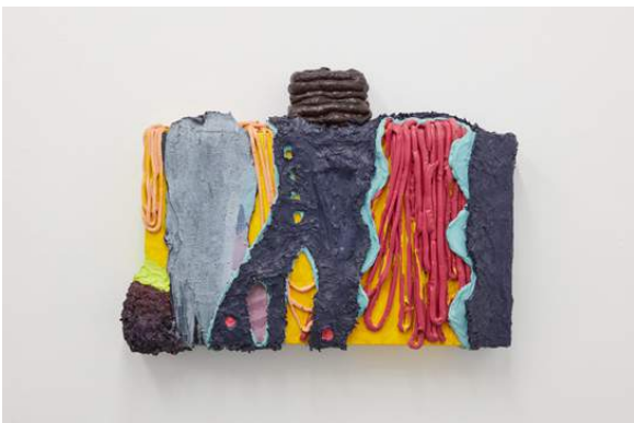
Untitled , 2016. Oil on canvas on panel. 23 x 31 x 5.5 inches