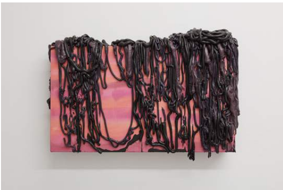
Untitled , 2016. Oil on canvas on panel. 20 x 30 x 6 inches

http://www.blouinartinfo.com/news/story/1709005/solo-exhibition-by-boris-ostrov-at-lubov-new-york