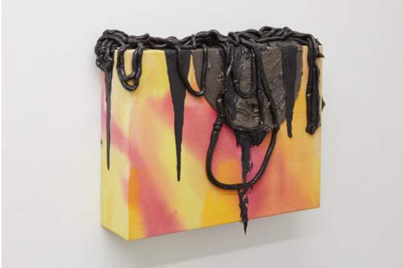
Untitled , 2016. Oil on canvas on panel. 17 x 21 x 7 inches