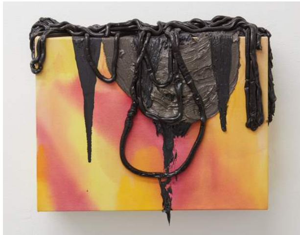
Untitled. Oil on canvas.

Keeping with its commitment of encouraging new works, Lubov, New York is presenting the first solo exhibition of Chicago-based artist Boris Ostrerov till January 8, 2017.