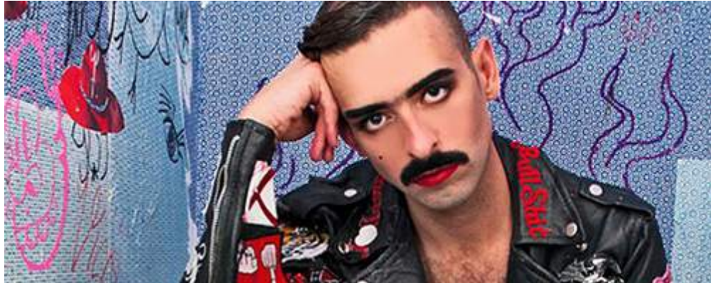
"The Meat Rack"